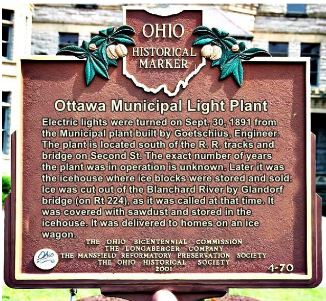
Original Ottawa Municipal Light Plant